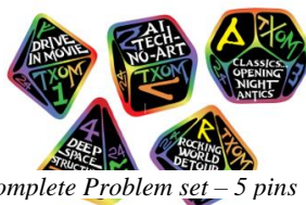
Complete Problem set – 5 pins